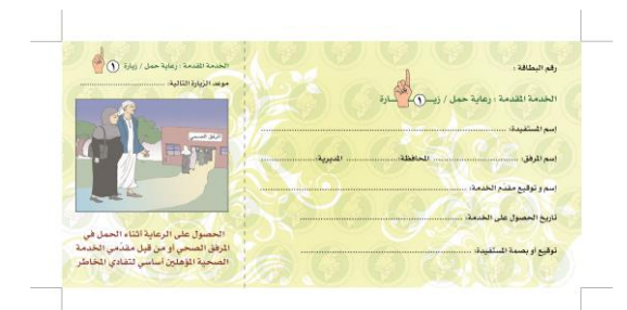
Figure 2: Voucher designs, Yemen Reproductive Health Voucher Programme

Vouchers could be used to reverse inequitable trends in countries that have been building universal coverage from the top down (e.g. Brazil, Kenya, Nigeria xvii), assuming that coverage will eventually trickle-down to the poorest in This is not a desirable pathway to universal health coverage in and serves to worsen inequitable access to care. Vouchers could begin to reverse this situation by adding health financing subsidies targeted to the poor. As discussed above, even well-established UHC systems could use vouchers to help ensure that effective coverage is truly equitable.